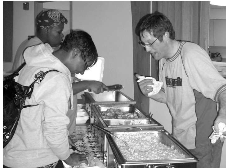
Volunteer- congregation meal time

Volunteer Appreciation Week is April 12-18, 2015. We'd like to thank all of the volunteers who support The Road Home and all the families we serve. In 2014, with your time, energy and dedication, we were able to provide services for 162 families, including 377 children. Thank you for your support of The Road Home!