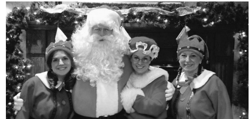
Santa and his elves

Thank you to all the companies, individuals, and congregations who donated carloads of much needed wish list items for our families.