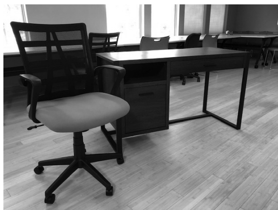
Donations of time for projects such as furniture assembly help us carry out our work.

Community members helped families in housing programs by donating Black hair care products through an Amazon Wish List. Over 80% of the families served by The Road Home are families of color, and products specifically designed to treat and style hair for many cultures is appreciated.