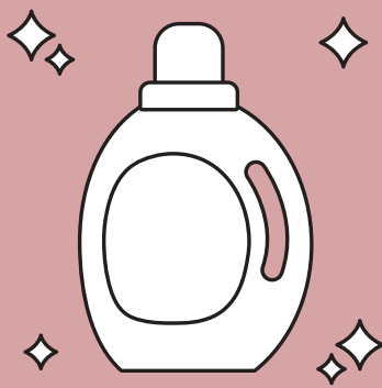
Laundry Detergent/ Bleach