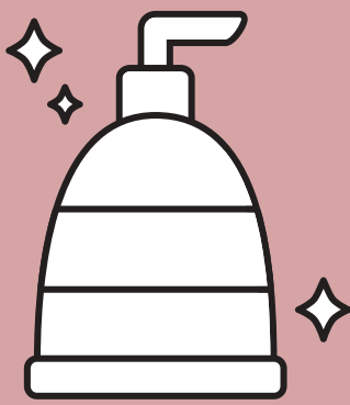
Dish Detergent / Soap